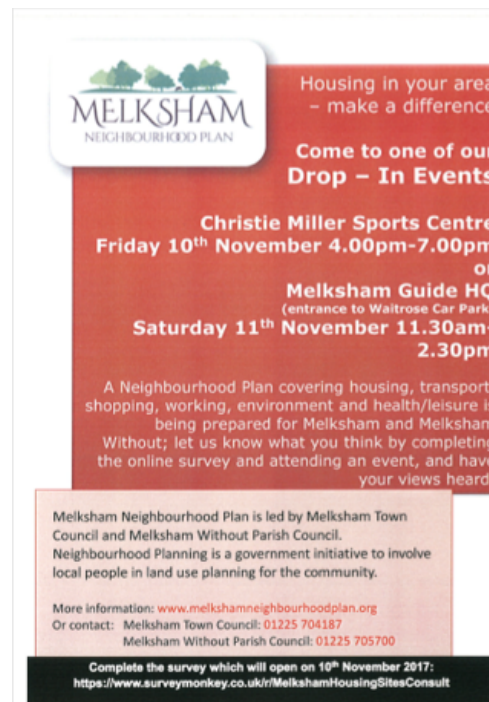
Examples of posters and advertisements in the local press